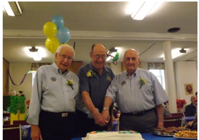
Our very special celebration, honouring our Lions with 50 plus years of service in 2012