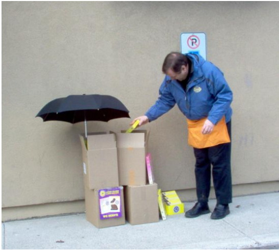
March 2006 – Chocolate Easter Bunnies Sale – in the drizzle - at the LCBO on Wellington Street near Grand Ave