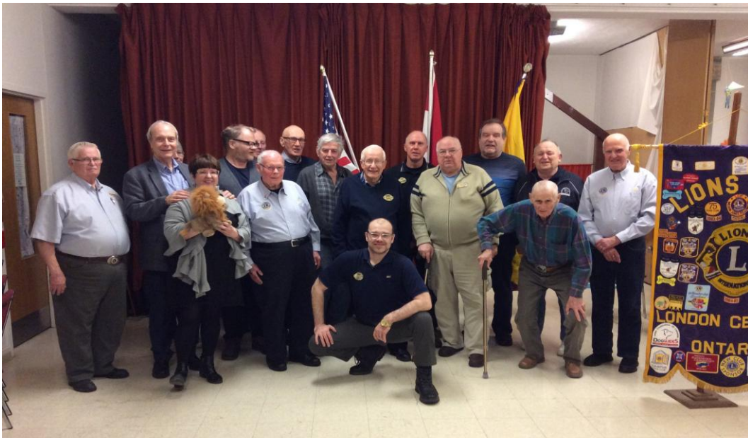
Some of our members hamming it up in February 2019 for an official group photo